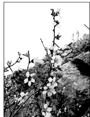
The Almond Tree in blossom on Samuel's Mountain, Israel