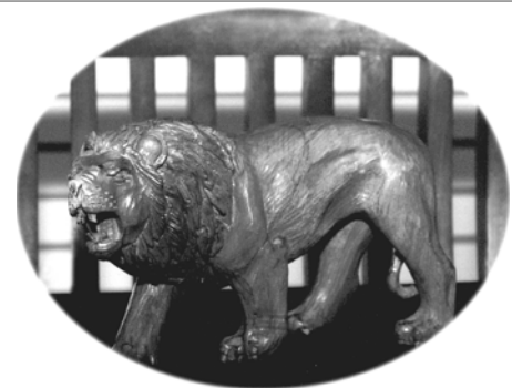
The Lion Roars!